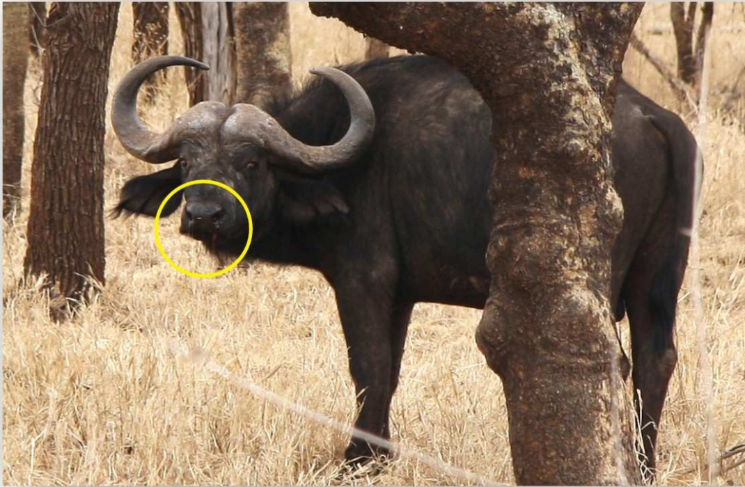
Figure 2: A young male buffalo was left behind by a departing herd during the Maswa Game Reserve outbreak in 2009. This animal showed lethargy, bloodshot eyes and nasal bleeding. It was euthanized and tested positive for anthrax. Because death from anthrax is often acute, it is very rare to see a clinical case of the disease in a live animal.