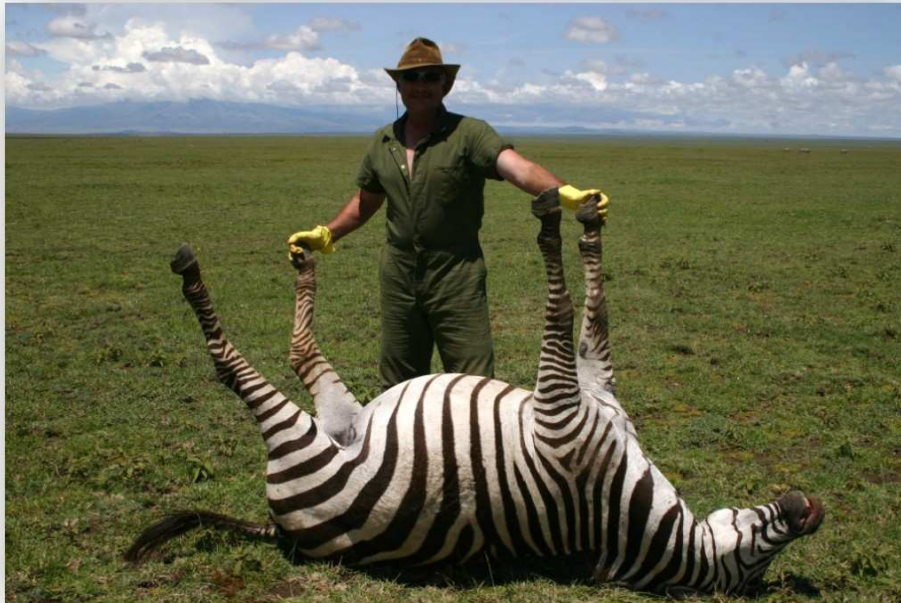
Figure 5: There is no need to be afraid of anthrax – it is a natural phenomenon. Interestingly anthrax is the oldest disease known to humankind, with the earliest records considered to be from ancient Egypt around 1500 BC; it was also the first disease shown to be caused by a micro-organism (in 1823), and the first against which a vaccine was attempted (in 1881). If anthrax is suspected use gloves and do not open the carcass (only a blood slide was taken from this zebra). Humans do not contract anthrax very easily – usually only through eating infected undercooked meat or processing hides. Anthrax used maliciously in the USA in 2001/2 was a highly-concentrated laboratory strain that would never be encountered in a domestic or wild animal situation. The most effective control measure is the regular use of anthrax vaccine in livestock.

If there are resources to do an aerial count and thus locate carcasses during or after an outbreak (as in Fig 2), these data are very useful. Enquiries about concurrent suspicious livestock deaths in populated regions adjoining wildlife areas are also very informative. The most effective control measure is to use anthrax vaccine in domestic livestock areas . The livestock vaccine is available in Tanzania and Kenya. It should be kept in a cold chain, and to maintain solid immunity annual revaccination is recommended.