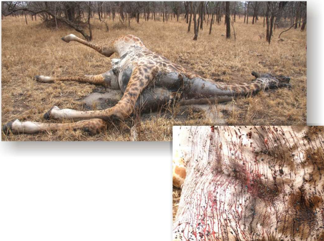
Figure 1: Carcass of a large male giraffe that died acutely of anthrax in Maswa Game Reserve, showing unusual haemorrhaging through intact skin.

contaminated by vultures drinking and bathing after feeding on anthrax carcasses. Thus winged scavengers may play an important role in spreading the disease in certain ecosystems over long distances. Apart from cases of carnivores scavenging on anthrax carcasses and occasionally succumbing to the disease, animal-to-animal transmission is not a common occurrence.